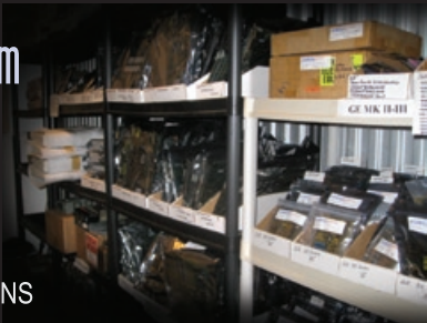
ABB | BAILEY | GE WESTINGHOUSE | SIEMENS

Please go to www.powergenics.com for our complete inventory.